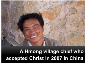
A Hmong village chief who accepted Christ in 2007 in China

And he has committed to us the message of reconciliation. We are therefore Christ's ambassadors, as though God were making his appeal through us. 2 Corinthians 5:19-20