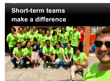
Short-term teams make a difference

I love missions, missionaries and seeing people engage in missions through the church.